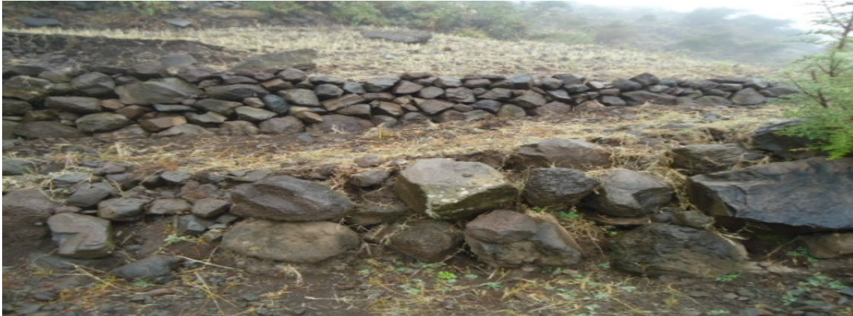
Figure 3.1: Stone bund in Guba-Lafto Woreda