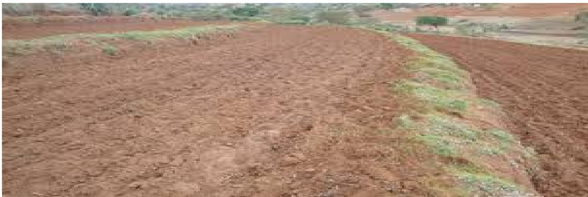
Figure 3.3: Fanya-juu terrace

dominated Amaymicha (8.5%) kebele. A check dam placed in the ditch, swale, or channel interrupts the flow of water and flattens the gradient of the channel, thereby reducing the velocity of run-off (MoARD, 2005).