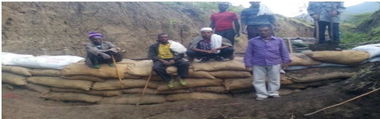
Figure 3.2: Check dams from Sand field bag in Guba-Lafto Woreda

(25%). But, the degree of implementation of grass strip in Shewat kebele (14.4%) is better than Amaymicha kebele (10.6%) (Table 3.3)..